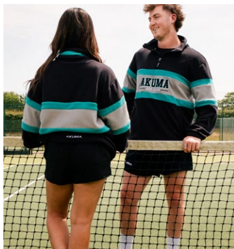
Male model is 5' 10" wearing a medium Female model is 5' 3" wearing a small